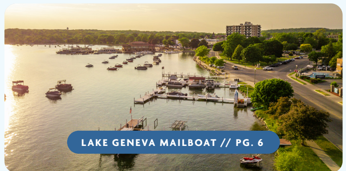
LAKE GENEVA MAILBOAT // PG. 6