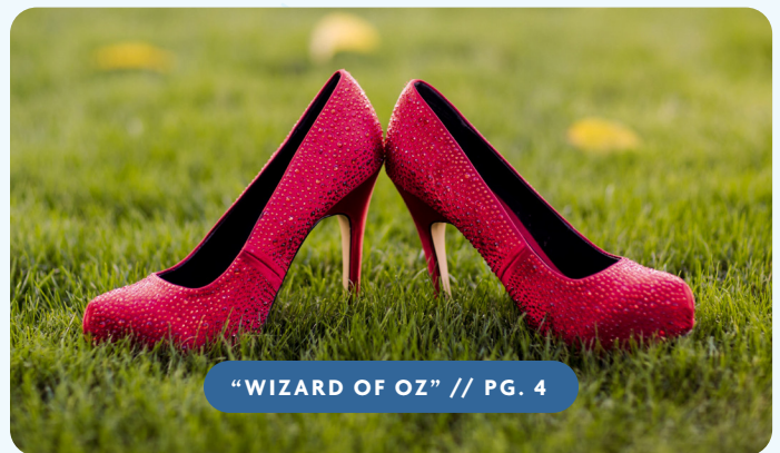
"WIZARD OF OZ" // PG. 4